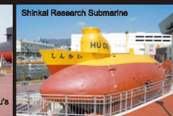
Shinkai Research Submarine