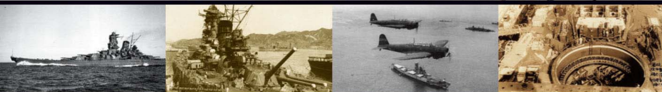
Battleship Yamato in an official trial off the coast of Sukumo, Kochi on October 30, 1941