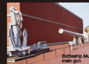
Battleship Mutsu's main gun

Shinkai Research Submarine can be found on the seaside area. Yamato Wharf introduces you to the full-scale length of the battleship "Yamato."