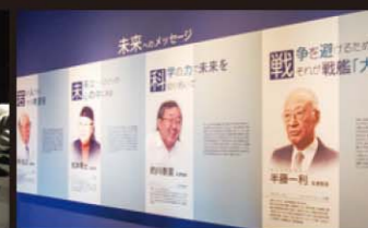
Messages to future generations